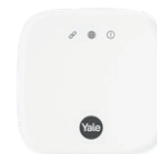
Yale Connect Plus Hub 2

Add the Yale Connect Plus Hub 2 and easily monitor and control your Yale products from your smart-phone.