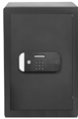
Maximum Security Motorised Safes